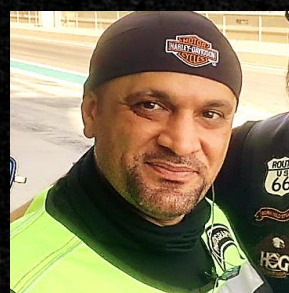
PHOTOGRAPHER "ABU JASEM"