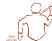
SPEED BUMP AHEAD